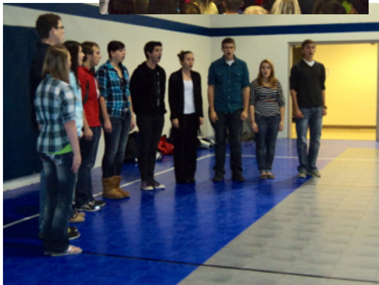
The HS Choral group sings "The Star Spangled Banner" and "America the Beautiful."